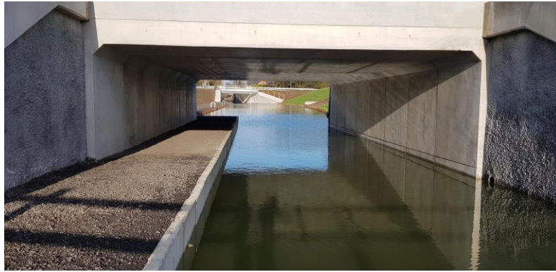
Completed A38 crossing

Members of the meeting congratulated Cotswold Canals Trust and Stroud DC team for securing funding for this project.