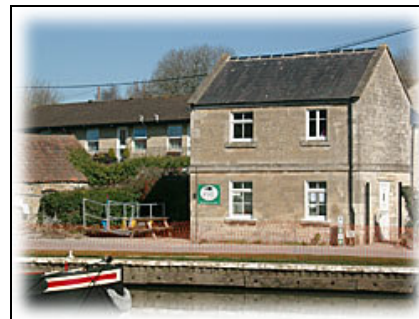
Above: Canal side café on Kennet & Avon

It is generally accepted that for every 5 people that visit the canal on boats, 95 additional visitors will either cycle or walk along the towpaths.