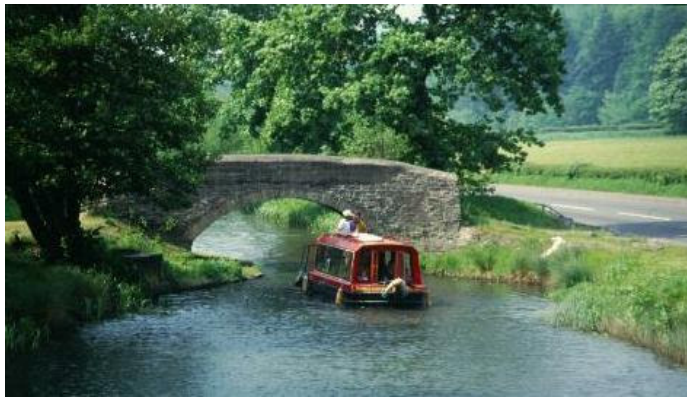
Above: The Cotswolds Canal, part of the Wessex Waterways Network

The W&B is an important link in the Wessex Waterways Network (refer to Figure 1). This network of canals originally linked the Severn and Thames Rivers to the North through the Cotswold Canals and to the south via the K&A. The W&B and the North Wilts Branch canal provide the central link and complete the network.