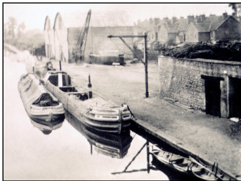
Below: Melksham Wharf c 1900

Trade dwindled with the opening of the Great Western Railway in 1841 and by 1906 the canal was no longer commercially viable and trade ended. In 1914 the canal was closed, and the rights of the canal company over the land and rights of way were extinguished. This resulted in subsequent development activity taking place without any recourse to the possible revitalisation of the canal route. This was the case in particular through the main urban centres at Melksham, Wantage and Abingdon.