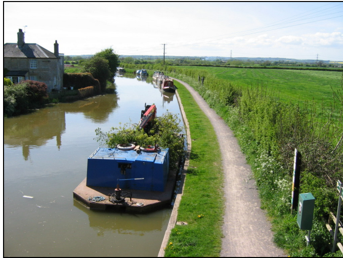
Above: Proposed connection point to K&A

A plan of this reach of the canal is shown in Figure 2a.