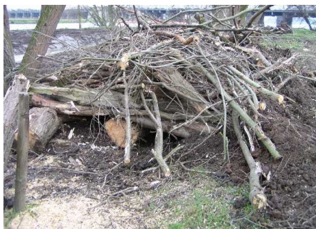
Below: Habitat creation - otter holt

Habitat creation including reed beds and bank reprofiling will also be carried out to mitigate any potential for permanent ecological adverse impacts due to the change in water level. These proposals will be developed further during the future planning and design stages of the project.