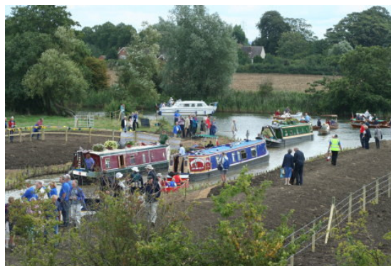
Above: Grand opening of Jubilee Junction, W&B Canal at Abingdon

The Wilts & Berks Canal Trust ('the Trust') is committed to the restoration of the W&B Canal (W&B) along its entire length from the Kennet & Avon Canal (K&A) at Semington to the River Thames at Abingdon as shown in Figure 1. As a priority the Trust are progressing four flagship projects: