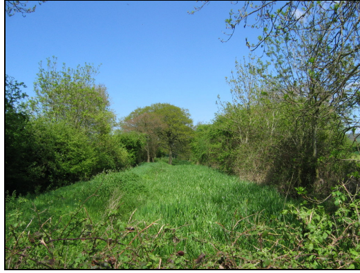
Above: Connection to existing alignment

The canal leaves the river and passes beneath the Millennium footbridge, which will be retained in a raised and extended position. To the north of the footbridge there is a lock, raising the canal above the existing ground level.