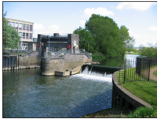
Above: Existing Melksham Gate weir and sluice to be demolished

The existing sluice and weir will be demolished as part of the works (see photo right). Detailed hydraulic modelling has concluded that this will lead to a small reduction in flood risk on the River Avon and its tributaries through Melksham. The works will also remove the existing risk that the Melksham Gate becomes stuck in the open position (an event that has recently occurred) leading to a drop in water level. Further details are provided in Appendix E. Removal of the existing weir will provide significant river restoration opportunities upstream of Melksham, which are discussed further in Appendix F.