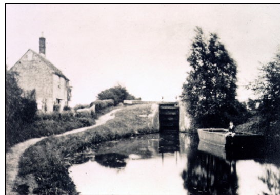
Above: Melksham Forest Lock c1900

The Wilts & Berks canal (W&B) was constructed between 1796 and 1810. The main line ran for 84 km from Semington with its junction on the Kennet & Avon canal (K&A), via Melksham, Swindon and Wantage to Abingdon on the River Thames. The canal was originally intended to carry 25-ton coal barges from the Somerset Coal canal, although agricultural produce, bricks & building materials were also carried at times.